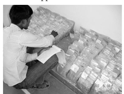
A collection of soil samples for testing

The Sehgal Foundation adopted the ISFM approach in Nuh