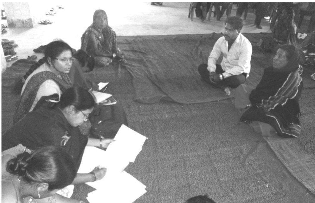
Paralegals document the statements of the victim and the accused

Initially, most of the cases were of domestic violence, largely because PRADAN had initiated training programmes around discrimination, violence and gender issues. NSK volunteers collected information from the neighbours and the relatives of the complainant, discussed the matter with the family members and tried to identify the causes behind the violence. A significant number of cases have been resolved through NSK, mainly through facilitation. NSK members also provide women with a different perspective and, in difficult cases, they even drew