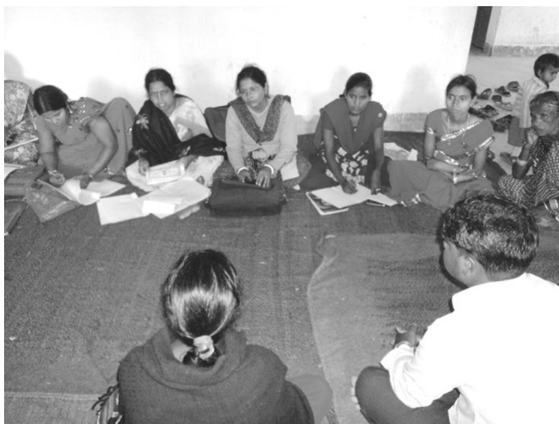
Hearing proceedings in the Nari Adalat

There was a huge struggle to establish NSK in the area. The villagers usually organized a panch (village-level informal court), based mainly on caste lines. The general practice at the panch was to receive some funds from both the parties as fees, discuss the issue amongst themselves and provide the verdict. Most times,