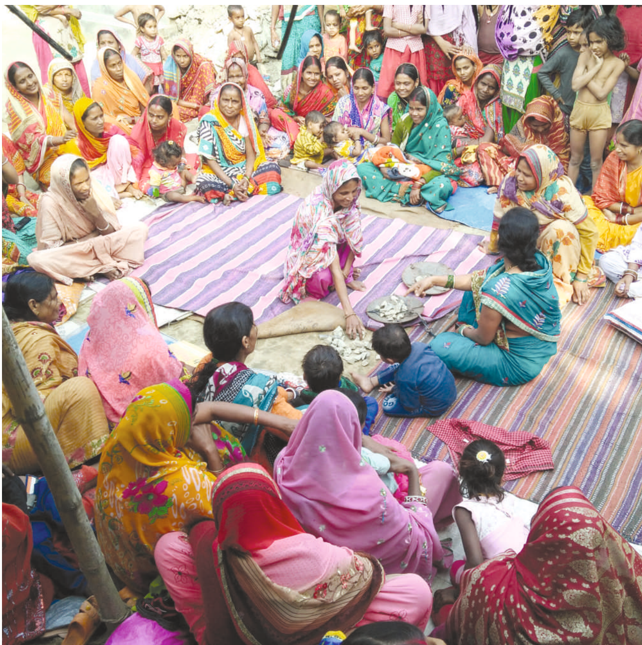
SHG members of Rahariya village, Araria district, Bihar, understand gender dynamics through games (p 27)