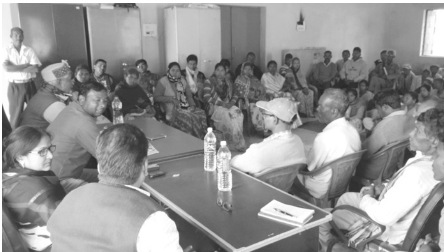
Community meeting at the Panchayat Bhawan

The cause of death of the girls was not known because the public health system in the area is extremely poor and none of the doctors or nurses came to examine the infants. The