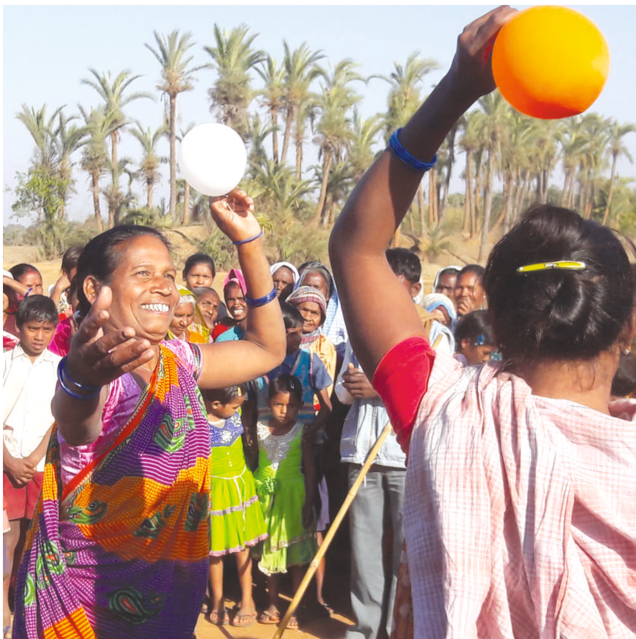
SHG members playing games at their annual panchayat -level meeting, Latta Dikwani panchayat , Poraiaayat district, Jharkhand (p 20)