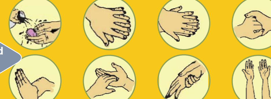
Steps of hand washing