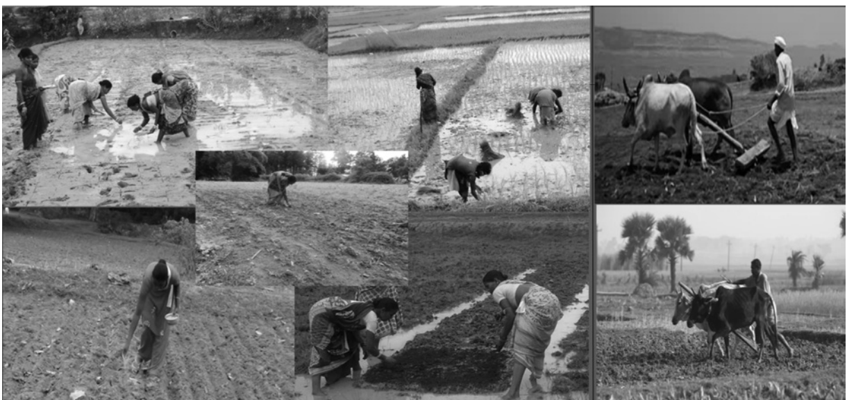
Figure 1: Scenes Showing the Division of Work among Men and Women in Agriculture

PRADAN's long-term vision is to bring about socio-economic transformation in women's lives. An inherent difficulty in conducting a meeting with women in the kharif season, however, is that a woman