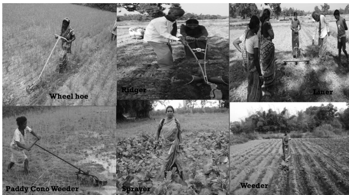
Figure 2: Women-friendly Tools Used in the Area