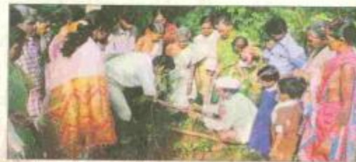
Mendha-Lekha gets rights to 1800 hectares

Will the government leave the forests to the good sense of the communities which may not always be the case? "That is how forests have traditionally survived," said Collec-