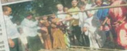
बांबू विक्रीने केला वनउपजावर मालकी हक्क