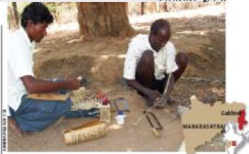
Villagers can sell bamboo items, but not bamboo

MENDHA LEXHA in Gadchiroli district of Maharashtra was one of the first two villages in India to claim community ownership over its forests last December. Six months after they got their forest titles, the tribal villagers find bureaucratic hurdles are hampering their powers under the Forest Rights Act of 2006.