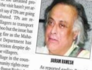
As reported earlier, Ramesh had written to state governments

VIVEK DESHPANDE NAGPUR | APRIL 23 UNION Environment and Forest Minister Jairam Ramesh, who will visit Mendha-Lekha village in Gadchiroli on April 27 is expected to make some "important" announcements, one of them pertaining to the much-disputed minor forest produce (MFP) bamboo. The village, however, hasn't yet been officially informed about the nature