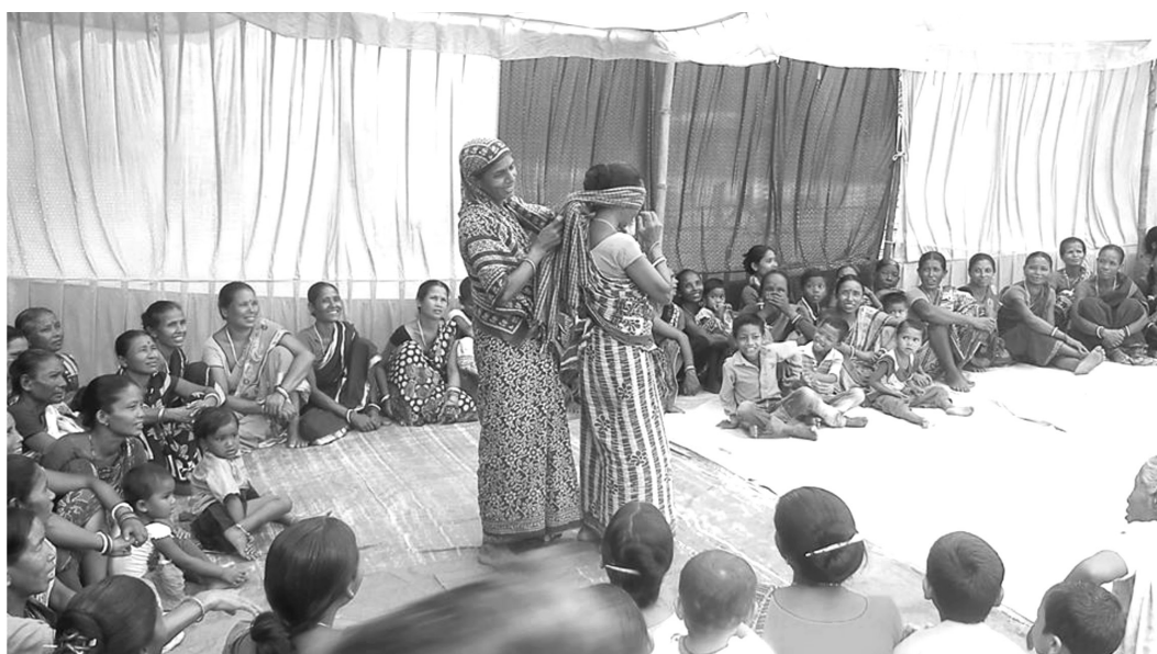
Fig. 1: Workshop on 'Women Getting Together' at Bhendrani village in Thakurganj block

To our amazement, they gathered more than 100 women from the adjoining hamlet and held a wonderful event. This was a great learning for the team, and we realized that at times we need to loosen our grip on the affairs of the community.