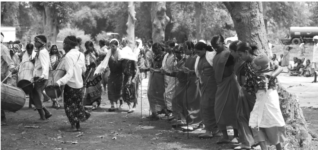
Fig 1: Bison-horn Madia dancing in Bastar Didi Mandai (SHG Maha-adhiveshan)

The Abhuj Madia are known for the ghotul system in every village—a youth dormitory for training of youth from both sexes (though this is rarely seen now), extensively studied by Verrier Elwin. Ghotul is a type of dormitory, comprising a large hut or group of huts enclosed in a compound, where unmarried boys and girls interact with each other. It has an elder facilitator, with young, unmarried boys and girls as its members. Girl members of the ghotul are called motiaris whereas boy members are called cheliks ; their leaders are called the belosa and siredar , respectively. The members are taught lessons of cleanliness, discipline, and hard work. They are taught to take pride in their appearance and to respect